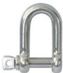
G210 Standard Shackle